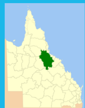
Upper Burdekin Rangelands

Peer learning is effective as the peer's and learners share similar experiences and that common experience has significant benefits. Graziers understand graziers and the issues they face on a day to day basis. The peer to peer service implemented in the Upper Burdekin Rangelands is proving to be instrumental for boosting industry adoption of forage budgeting.